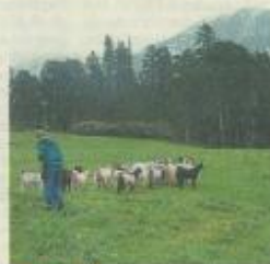
BLISS IS THIS It is easy to get lost here.

GUJJAR HUT IS A TINY SETTLEMENT OF LOCAL TRIBES, MOSTLY SHEPHERDS. WE WALKED TO SACRED 'KHERATAT' (SERPENT LAKE) THAT HAS WATER ALL YEAR ROUND.