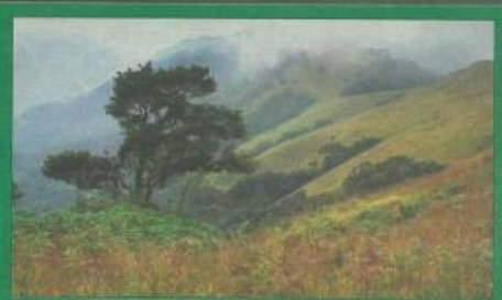
Walking into the clouds